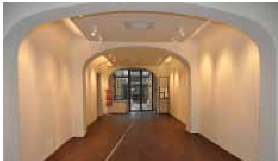
San Gallo Gallery