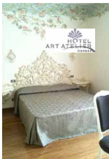
Hotel Art Atelier