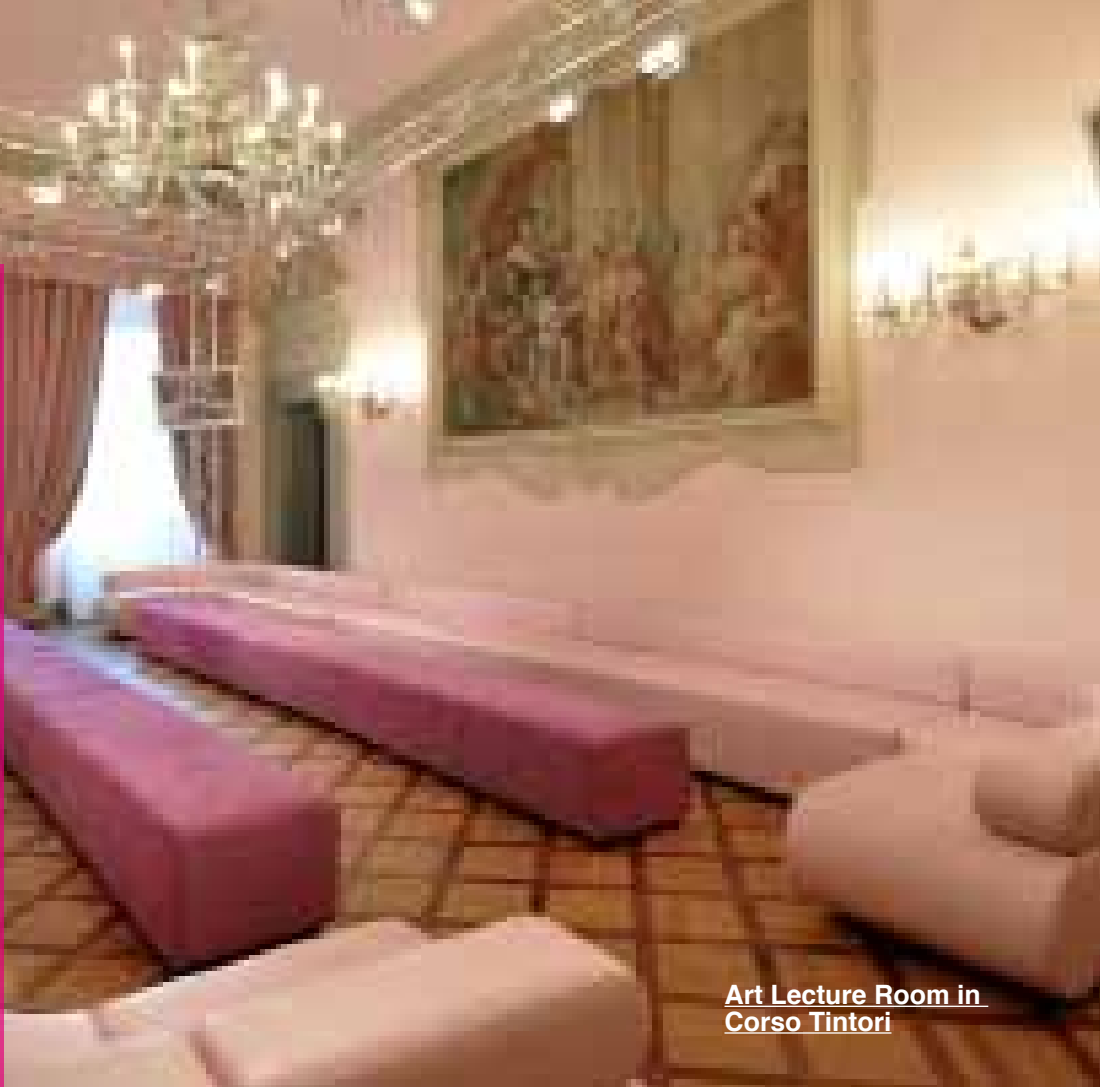
Art Lecture Room in Corso Tintori

In this course, students will work on pottery and/or ceramic sculpture projects. In the first two days, emphasis will be on different clay hand-building techniques. In the third and final day of the course, students will progress to a variety of surface decoration techniques and different methods of firing. This course can be offered at introductory and intermediate levels, intermediate students will use the ceramics wheel also.